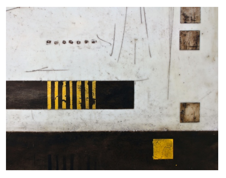
Nov 20 - Dec 20, reception: Sun. Nov 22, 12:30-2PM - Night Gold - Paul Roorda

Paul Roorda uses gold leaf, ashes, beeswax and old book pages to explore changing belief systems and the passage of time. The art in this exhibition makes reference to icons, horizons, aging walls and ritual markings to contrast tension and emotional paralysis with the possibility of renewed reflection and understanding.