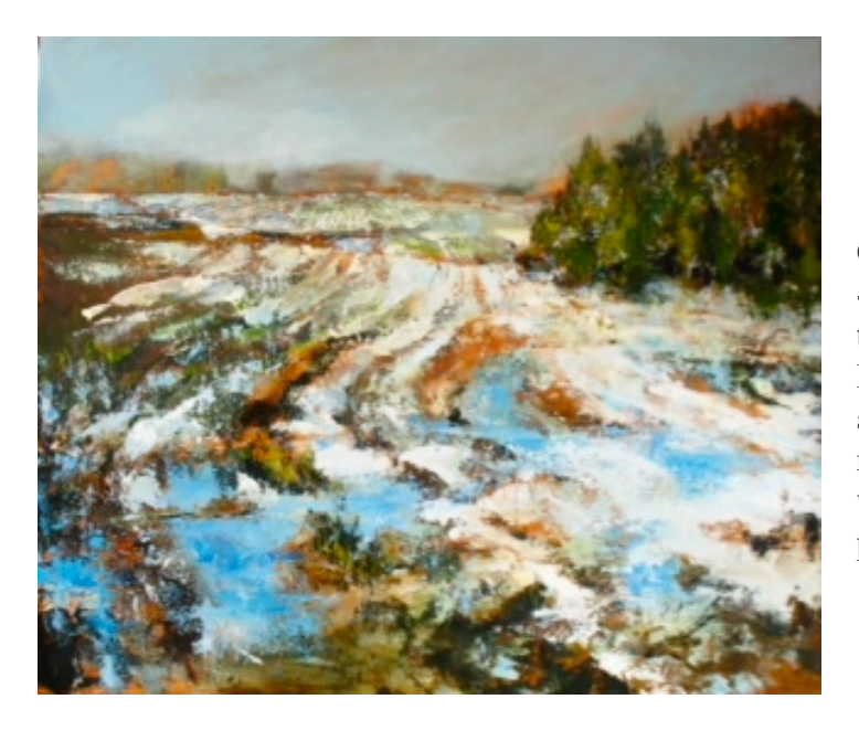
Oct 17 - Nov 19, reception: Sun. Oct 18, 12:30-2PM - Breathing Space - Carol Westcott. The artworks in this exhibition depict reconnection with the swampy lowlands and rugged woodlands that provide the atmosphere of the Ontario landscape. It is as if the natural landscape offers extra breathing space and a way to take it all in. In her paintings, Carol Westcott presents views of these landscape moments.