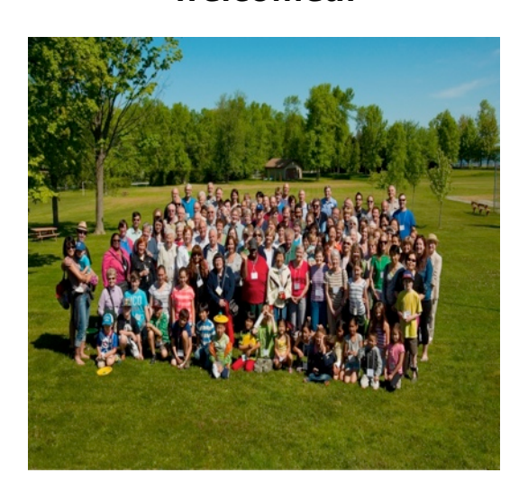
Registration will take place in January and February 2016.